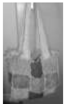
Samples of bags made at a previous session.

Heaps of different projects we can make and you can decide what we would like to make. All the material and everything you need will be available on the day.