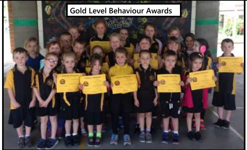
Gold Level Behaviour Awards