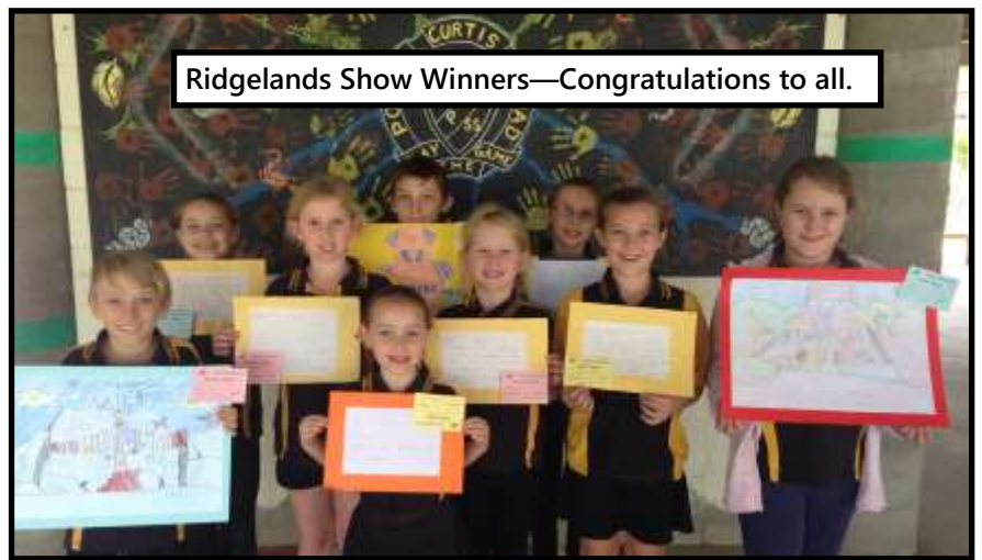
Ridgelands Show Winners—Congratulations to all.