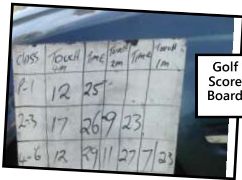
Golf Score Board